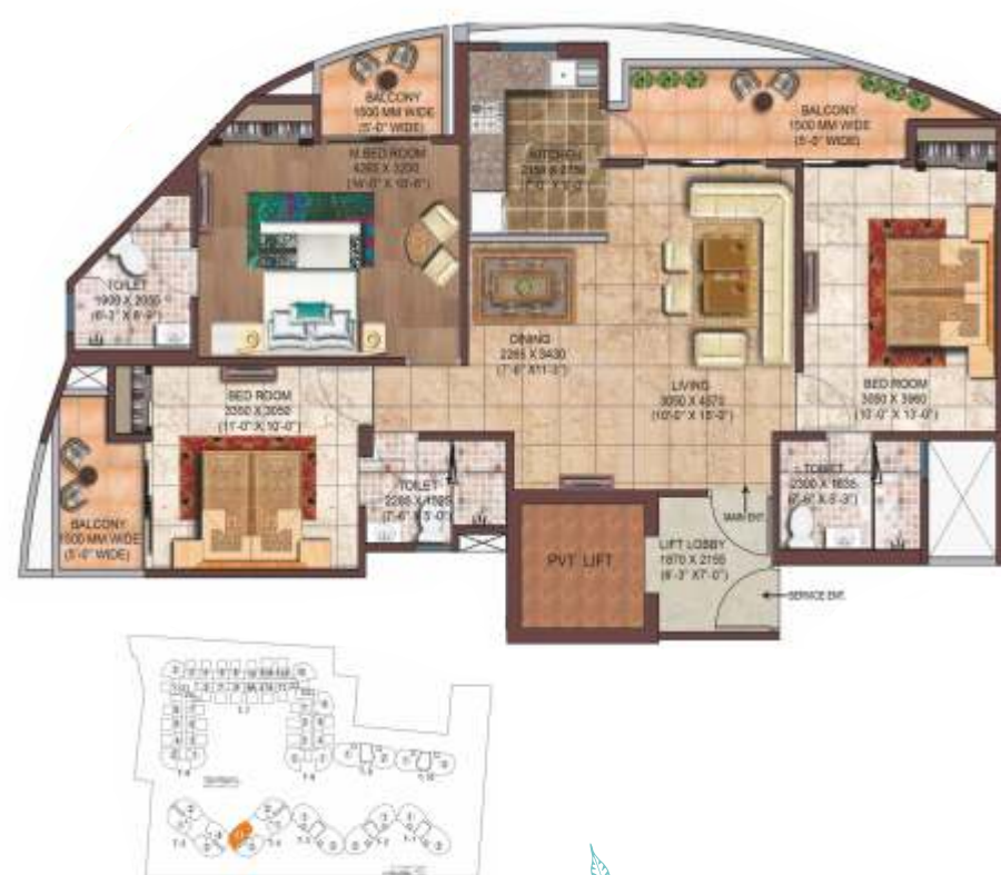
3 Bedrooms + 3 Toilets + Pvt. Lift (1733 sq.ft.) (Type - 1)