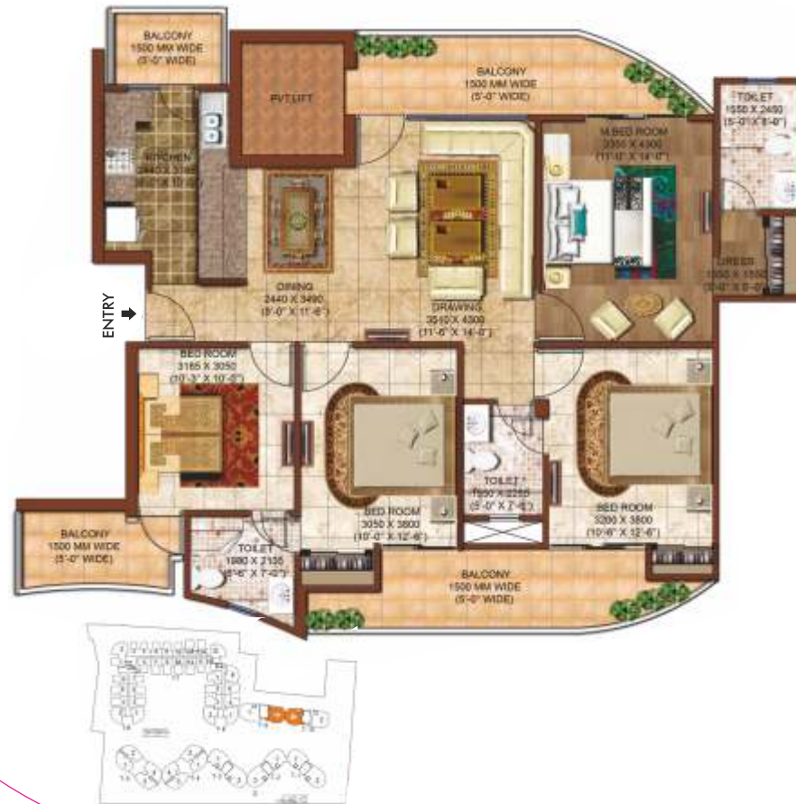
4 Bedrooms + 3 Toilets Units (2095 sq.ft.) (Type - 1)